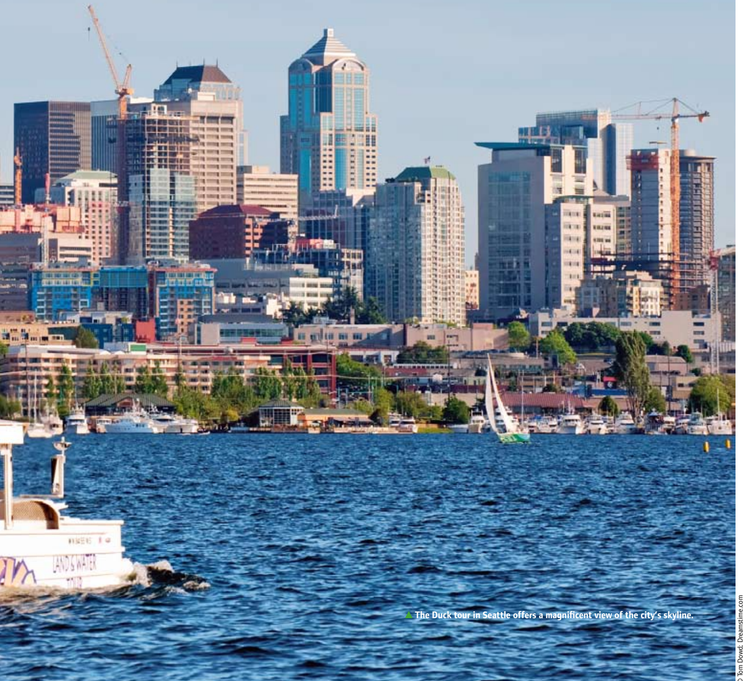
▲ The Duck tour in Seattle offers a magnificent view of the city’s skyline.

The allied forces during the early days of WWII faced a tactical dilemma – that of unloading cargo or men from their ships at