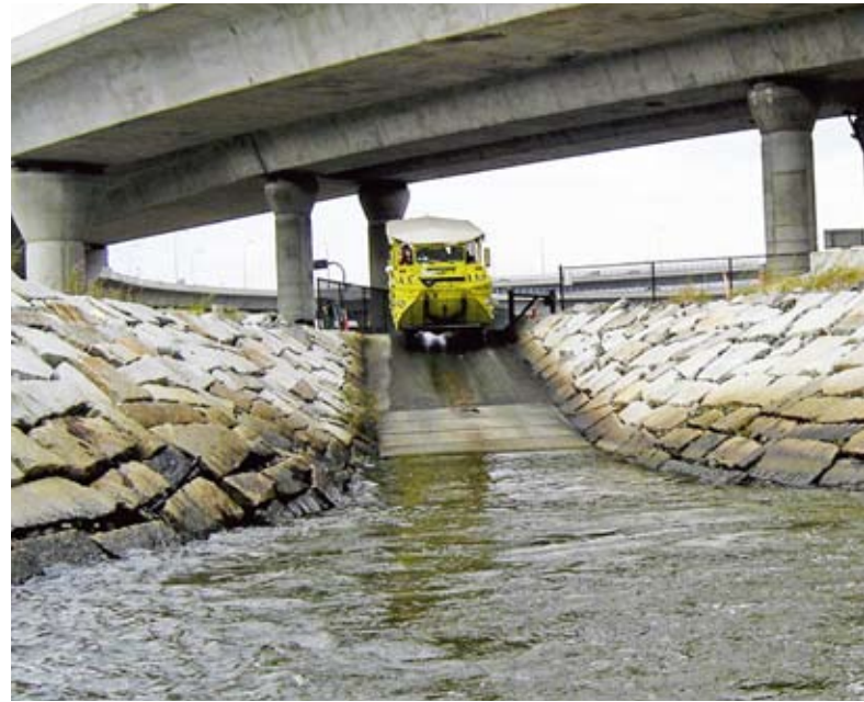
▲ The Ducks make a big splash when entering water, so it needs a separate entry point, like this one in Boston.

Tour operators are replacing original DUKWs with modified or newer ones, as they are easy to operate, maintain and can accommodate more tourists. Most Ducks have been repainted with vibrant colours, with enclosed tops and modern diesel engines, resembling conventional buses. Tours have been customised for different target audiences today, and history, chartered, party or educational are some of the common themes.