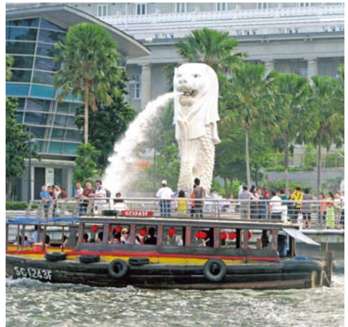
▲ Above: The Merlion Park in Singapore is a popular spot for Ducks. Top: A Boston Duck cruises through the Charles River.

One needs to hold tight to one's seat as the Duck waddles away. Even as one is getting comfortably cuddled up in one's seat, the Duck decides to go right into the river. Seems like a subtle slide from the outside, but from the inside, one can feel the big splash of the river generated by the Duck.